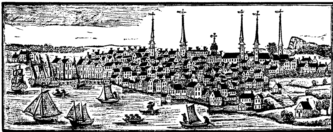
A Southeast View of New Haven in 1786, from the New Haven Chronicle of that year

Empire of Liberty: A History of the Early Republic, 1789–1815 , by Gordon S. Wood. Oxford University Press, 800 pages, $35